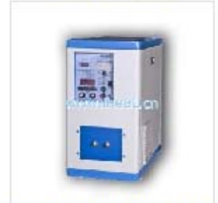
HX-06A-UHF Ultra-High Frequency Induction Heating Machine