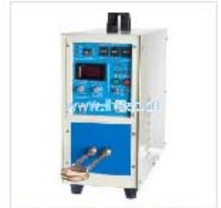
HX-15A-HF Induction Heating Machine