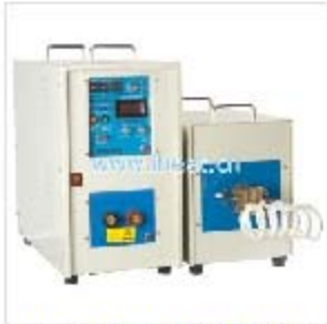
HX-40AB-HF Induction Heating Machine