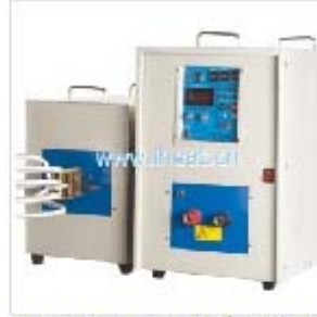
HX-80AB-HF Induction Heating Machine