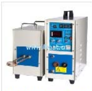
HX-15AB-HF Induction Heating Machine