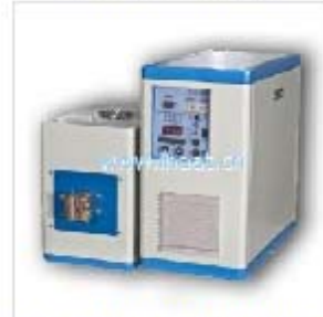
HX-20AB-UHF Ultra-High Frequency Induction Heating Machine