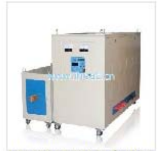
HX-250AB-MF Induction Heating Machine