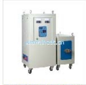
HX-100AB-HF Induction Heating Machine