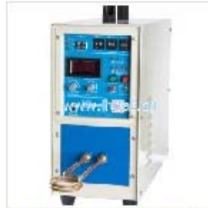
HX-25A-HF Induction Heating Machine