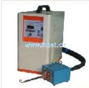
HX-10AB-UHF Ultra-High Frequency Induction Heating Machine