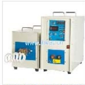
HX-40AB-MF Induction Heating Machine