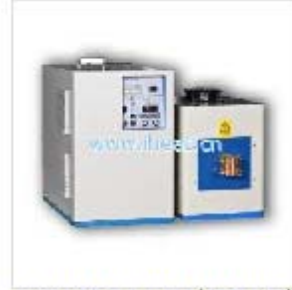
HX-40AB-UHF Ultra-High Frequency Induction Heating Machine