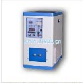
HX-10A-UHF Ultra-High Frequency Induction Heating Machine