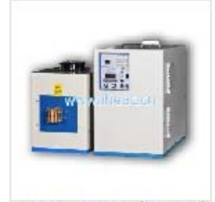
HX-60AB-UHF Ultra-High Frequency Induction Heating Machine