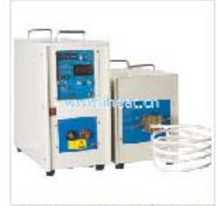
HX-60AB-HF Induction Heating Machine