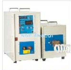
HX-30AB-HF Induction Heating Machine