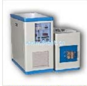
HX-30AB-UHF Ultra-High Frequency Induction Heating Machine