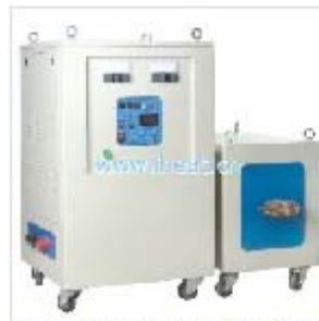
HX-80AB-MF Induction Heating Machine