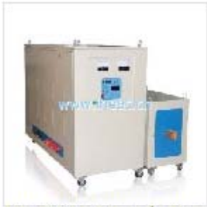
HX-200AB-MF Induction Heating Machine