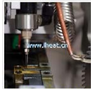
HX-CNC auto saw tooth induction welding machine