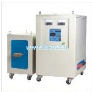
HX-160AB-MF Induction Heating Machine