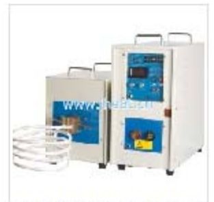
HX-60AB-MF Induction Heating Machine