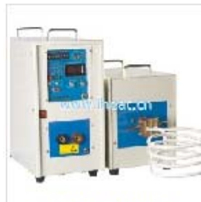
HX-70AB-HF High Induction Heating Machine