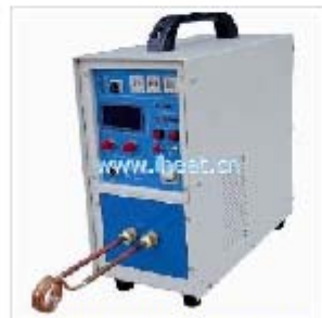
HX-05A-HF Induction Heating Machine