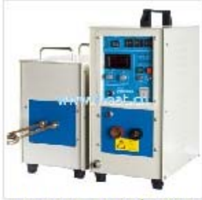
HX-25AB-HF Induction Heating Machine