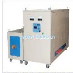
HX-300AB-MF Induction Heating Machine