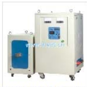
HX-120AB-MF Induction Heating Machine